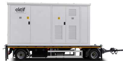
SMS - 1