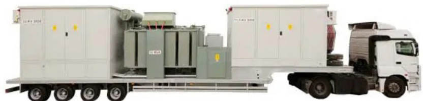
SMS - 2