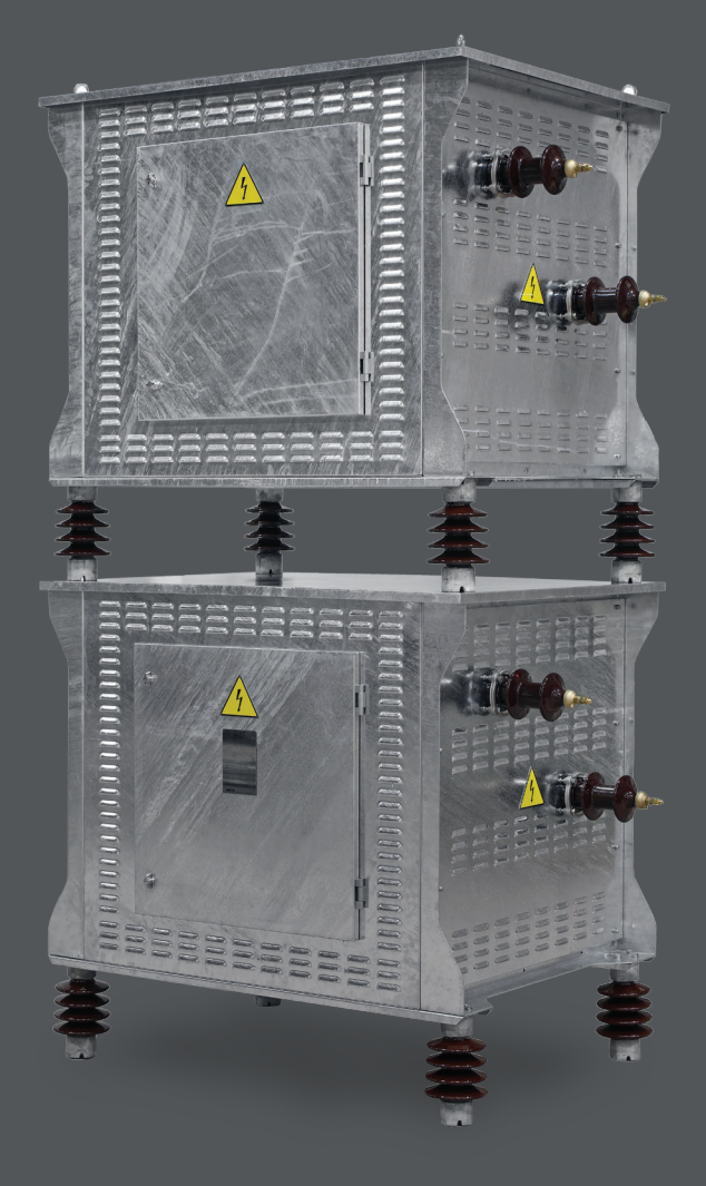
FR Series FRF | FRC | FRL | FRD | FRH